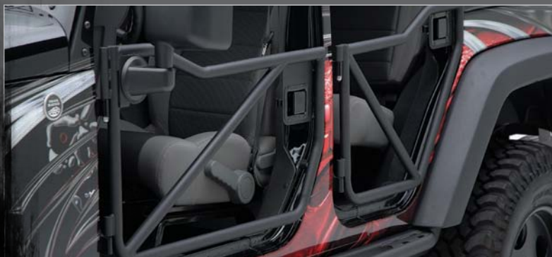
RS6216B FRONT TUBE DOORS RS6217B REAR TUBE DOORS