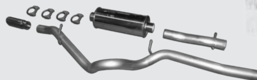
RS720001 - 4DR Jeep JK Exhaust RS720002 - 2DR Jeep JK Exhaust