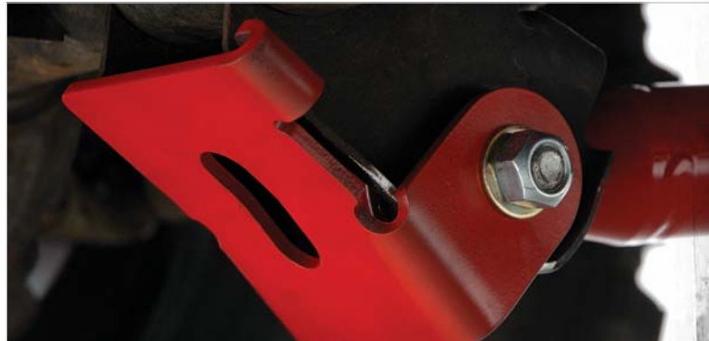
RS6210 CONTROL ARM SKIDS