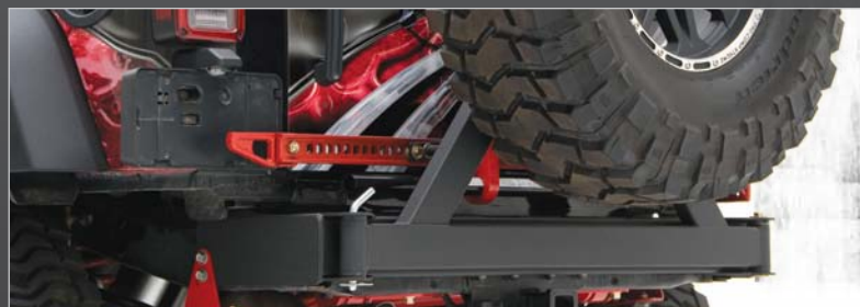
RS6221B REAR BUMPER WITH TIRE CARRIER