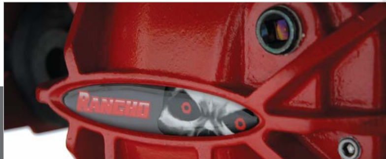
RS6209 DANA 44 DIFF COVER RS6213 DANA 35 DIFF COVER RS6218 DANA 30 DIFF COVER