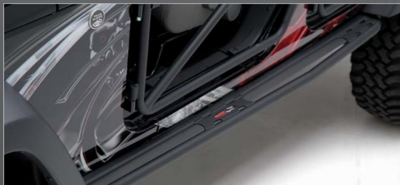
RS6214B 2 DOOR SLIDERS RS6215B 4 DOOR SLIDERS