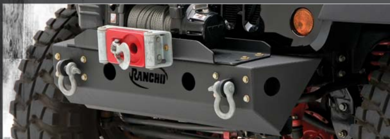
RS6220B FRONT BUMPER