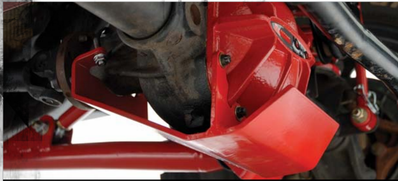
RS6212 DANA 44 FRONT DIFF GLIDE PLATE RS6222 DANA 30 FRONT DIFF GLIDE PLATE