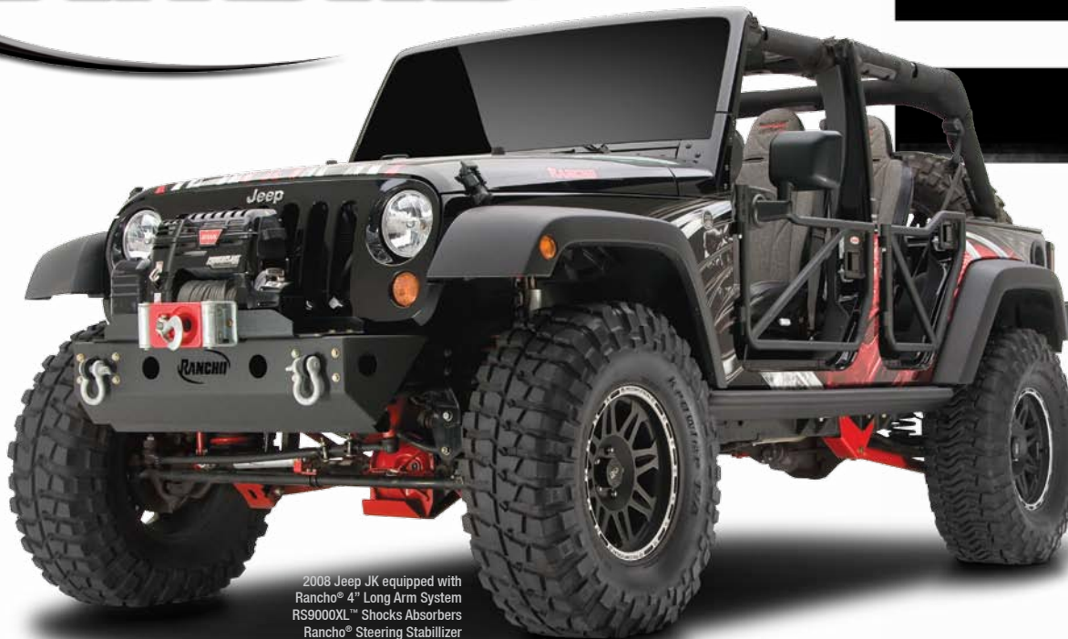
2008 Jeep JK equipped with Rancho® 4" Long Arm System RS9000XL™ Shocks Absorbers Rancho® Steering Stabilizer Rancho® RockGear™