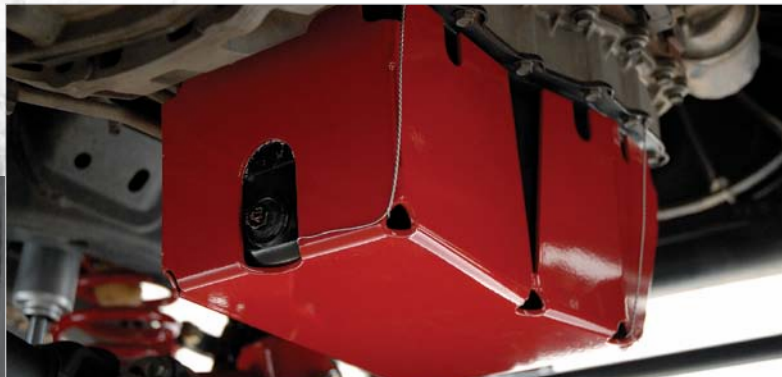
RS6208 OIL PAN PROTECTION